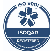
Cert No. 1122